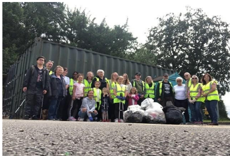
Members of Fernwood Community Church after their litter pick in July