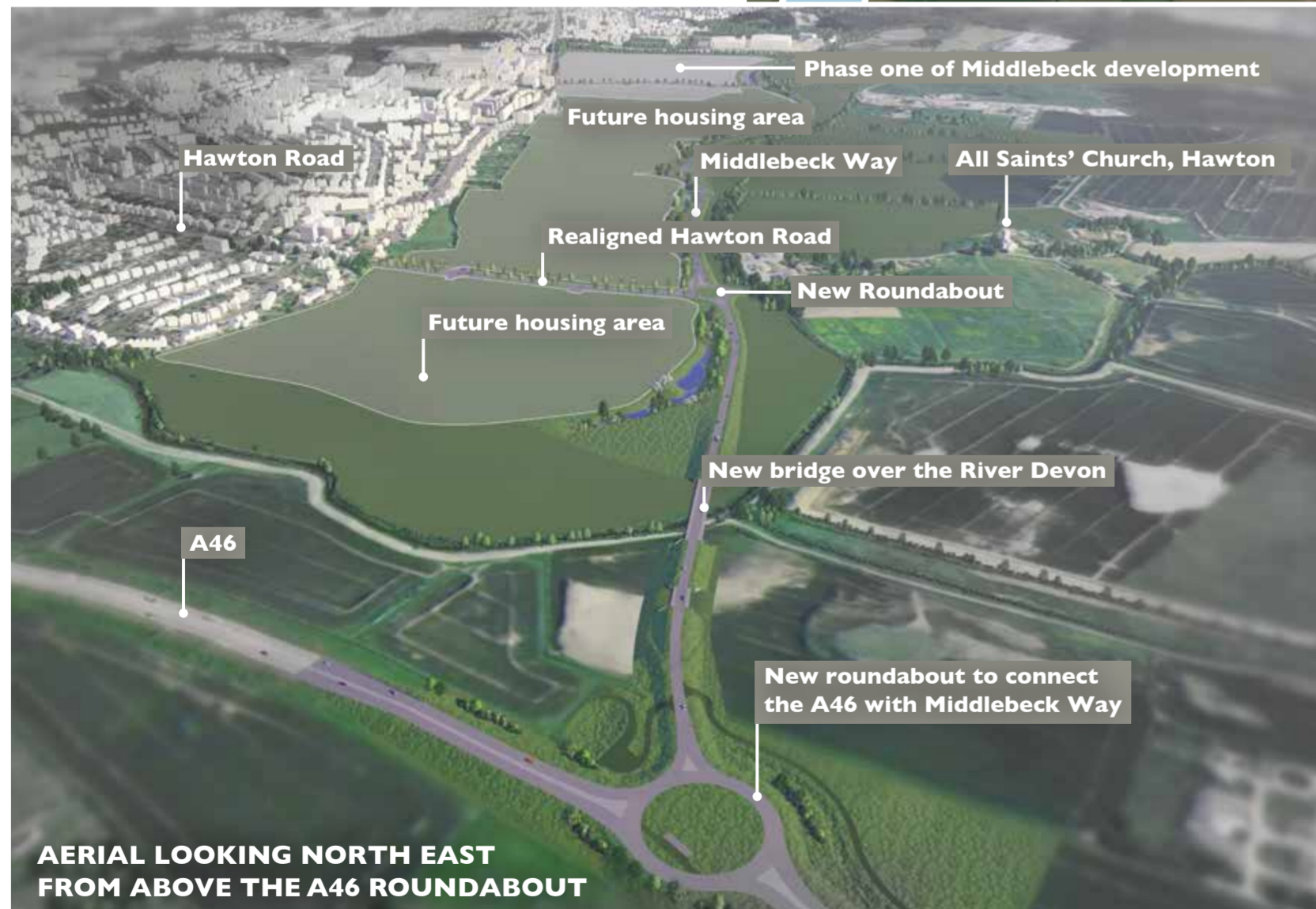
AERIAL LOOKING NORTH EAST FROM ABOVE THE A46 ROUNDABOUT

Staple Lane will be permanently closed to through traffic, where the road is currently closed, with residential access only from its existing junction with London Road. Traffic will instead enter the new Southern Link Road via the new roundabout near Welcome Break Services, as shown below.