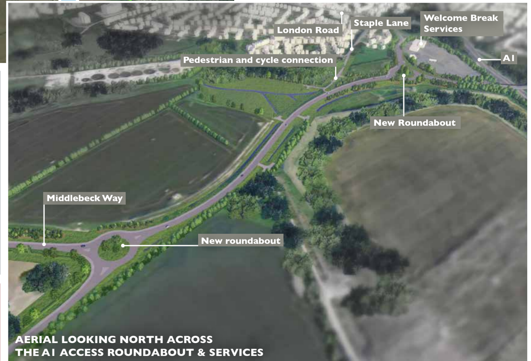
AERIAL LOOKING NORTH ACROSS THE A1 ACCESS ROUNDABOUT & SERVICES