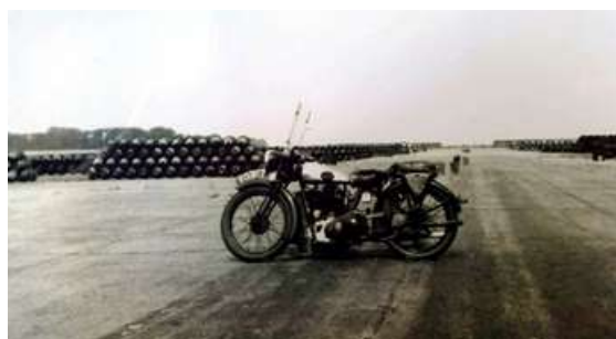
Bombs on the runway

During May a number of Italian POWs were located on the station and arrangements made for their duties. On the 18 May 1945 Balderton [and Fulbeck] was taken over by No.93 MU and returned surplus HE (high explosive) and Incendiaries began to be received from No.5 Group Bomber Command stations. Storage space was also provided for continued receipts of HE from ports of discharge and from filling factories at home, collected ordnance - 4,000lb bombs and general ammunition from other disused stations - were stored on the runways. In June all stores were being returned by road and a report stated that both places would be practically filled by the end of the month and estimating that Fulbeck would have 10,000 tons and Balderton 12,000 tons.